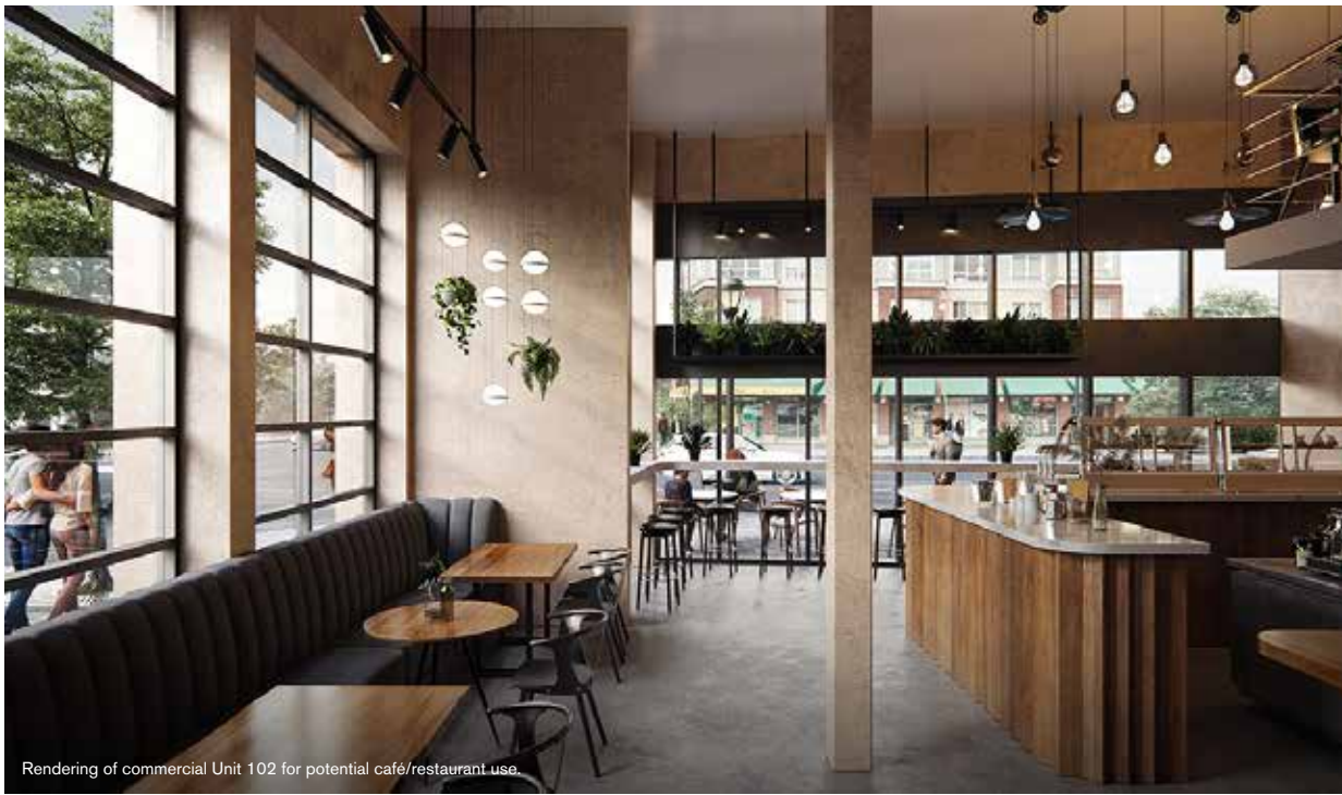
Rendering of commercial Unit 102 for potential café/restaurant use.